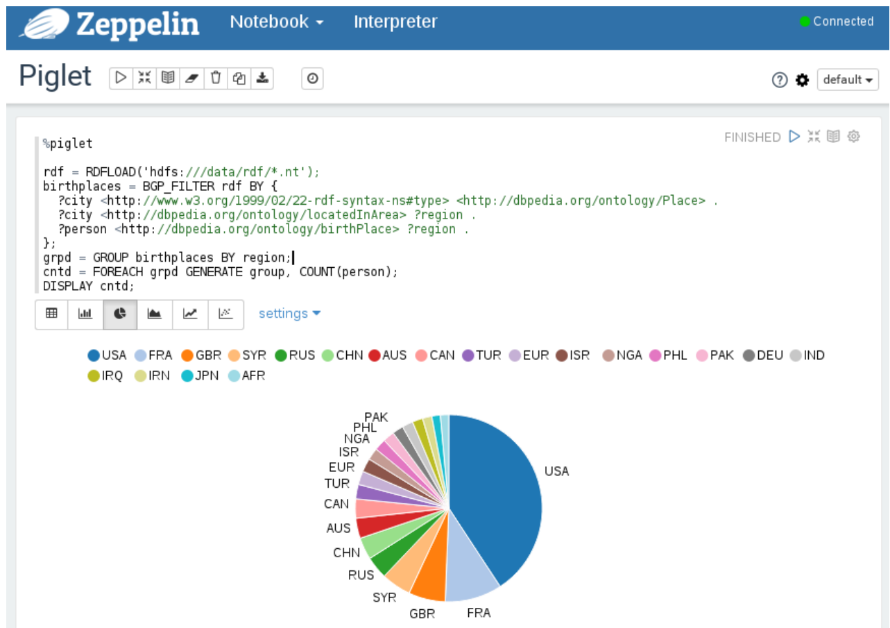
Figure 2: A screenshot of Zeppelin with a Piglet script that contains a BGP_FILTER mixed with traditional operators.