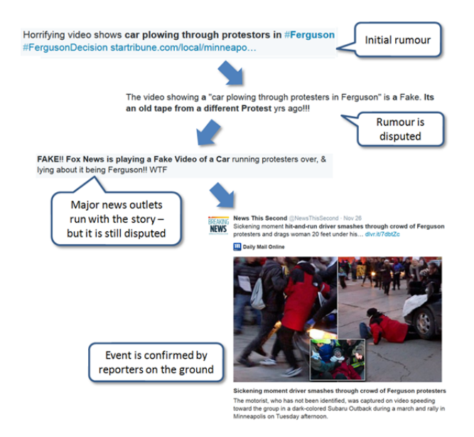
Figure 1: Example rumour discussed from Twitter.

Copyright is held by the International World Wide Web Conference Committee (IW3C2). IW3C2 reserves the right to provide a hyperlink to the author's site if the Material is used in electronic media. WWW 2015 Companion , May 18–22, 2015, Florence, Italy. ACM 978-1-4503-3473-0/15/05. http://dx.doi.org/10.1145/2740908.2742573.