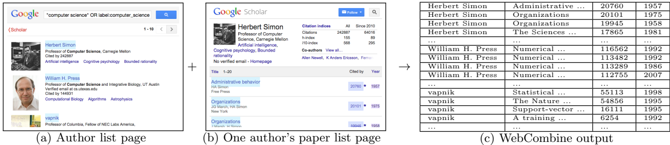
Figure 1: To use WebCombine to scrape data from Google Scholar, the user first identifies the list of authors by clicking on author names. Next the user demonstrates how to access the citations page for one author (by clicking on the link). On the resultant page, the user identifies the list of papers. WebCombine uses these demonstrations to automatically scrape the website, producing a single table of papers with each paper’s author, title, citation count, and year.

dated before scraping the price, even though a price node is already present. After recording this interaction, CoScripter would issue the same events — a click on the option button and a scrape action on the price node. However, because standard R+R tools like CoScripter have no mechanism for recognizing that they must wait for new data to load, it scrapes the price before the page is updated, and thus collects the previous price. This page does contain a logical table, the list of prices, but standard R+R cannot replay the interactions required to access it.