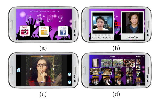
Figure 3: (a) Interface of the mobile application, (b) Annotation result using a captured photo, (c) Edit and crop image, and (d) Access the photo albums on the Facebook.

trieval database. The middle number indicates the similarity value between the query image and the most similar facial image. By clicking the Facebook button below the similar number, users can share the annotation results with their friends via social networks. FANS also allows users to rate the annotation results in FANS App. In particular, under the query image, a bar of five star is given to let users vote the annotation result. For a large size image, users can crop out the facial image region with FANS App as the query image, as shown in Figure 3 (c). By clicking the second button or the third button, users can respectively access the album images in the mobile device or in their Facebook account, so as to explore facial images as queries to interact with FANS, as shown in Figure 3 (d).