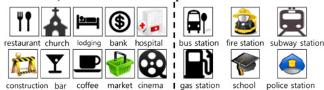
Figure 4. Sample of different icons used in the game

The user is shown an icon and is expected to drag the icon to the appropriate location on the street view and confirm the chosen location by selecting the checkmark; if the icon does not exist in that particular street view, then the user selects 'X'. A sample of the different icons used in the game is shown in Figure 4. In order to keep the game simple and entertaining, the following three features were added: 1) only one icon is shown at a time and the user has a limited time to make a decision; 2) the user's score is updated based on the accuracy and timer; and 3) a competition is also used to garner more interest. The upper right corner of the screenshot in ① in Figure 3 presents a map of the current location and the destination. The street view "moves" toward the target destination and it changes once the icon is selected (either checkmark or 'X') or if the timer expires.