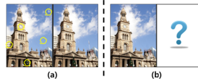
Figure 2. An example of (a) the Hidden Catch game and (b) the Hidden View game with an unknown image

In this work, we attempt to provide updates to old data in street view by designing a human computation game called “Hidden View” that was designed for users to identify differences between a stored image and the current real world. The game is based on similar principles to the “Hidden Catch” game, which provides two images with subtle differences that the user identifies (Figure 2(a)). This type of game is very straightforward and depending on the subtlety of the differences, the difficulty of the game is increases or decreases. If necessary, the computer can easily solve this problem by comparing the images. However, if one of the reference images is not available (e.g. Figure 2(b)), then the “Hidden Catch” game cannot be completed by a computer. In this work, the Hidden View game is proposed; it is based on similar principles to those in the Hidden Catch game, i.e. leveraging the familiarity of the users/players with the street views in order to identify the differences.