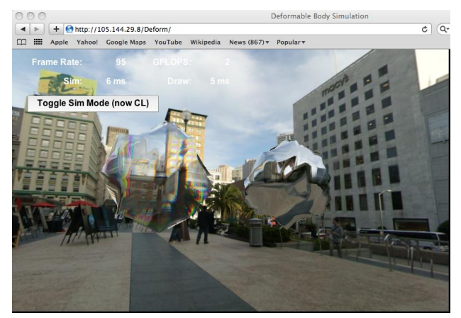
Fig. 3: Deformable body simulation (WebCL)

The performance comparison of JavaScript vs. WebCL is summarized in Table 1. The performance metrics used are: the computation time in Sobel filter, and the frame rate in N-body simulation and deformable body simulation.