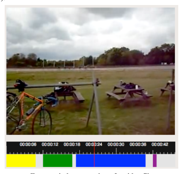
Four periods annotation of a video file

Annotation of videos are quite similar to the annotation of sounds, it's a temporal segment of a video file. A period or a marker annotation of a video file doesn't define a shape in the video stream. This is not in the timeline-js scope to deal with video stream annotation, but it can be define outside, using events (cf. 3.4).