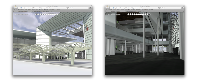
Figure 2: Architectural walk-through model of Hall 11 of the Fair of Frankfurt – represented and rendered using our new image geometry approach for fast content delivery and data compression.

The two screenshots in the middle are external showcases: the left image shows a GIS application with a floodwater