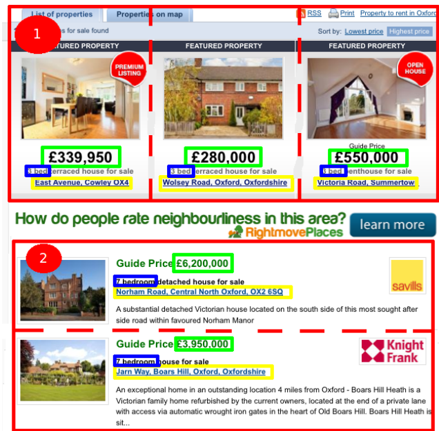
Figure 2: A Result Page Example

Page Segmentation. This phase proceeds in three sub steps, turning a page into a set of data areas consisting of individual records: During (1) page retrieval & annotation , AMBER loads and renders a page, evaluates all embedded scripts, and annotates the contained domain terms, using GATE [2] as annotation engine. We provide the necessary terms as gazetteer lists, which are ini-