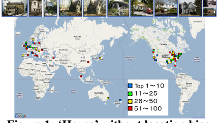
Figure 1: ‘House’ without location bias.