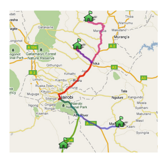
Figure 3: Map of the 5 participating schools of our large-scale pilot.

ally contained mostly dead links. We removed these pages from the index for our larger pilot. In addition, we implemented a Firefox browser extension to highlight links that are found in the cache so users could avoid clicking on links.