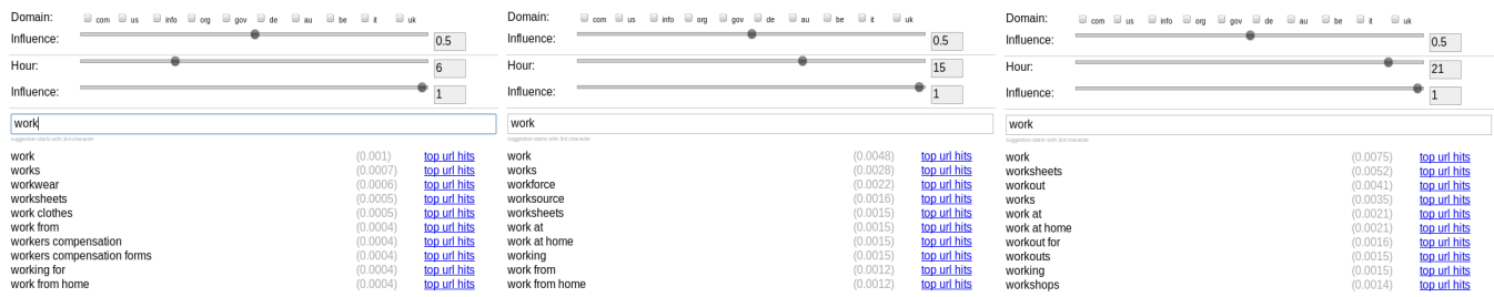
Figure 3: AOL-query suggestion showing completions for query work at 6 am, 3 pm and 9 pm.

timestamp as a statistical observation. We also extract the country domain of the clicked URL as a discrete observation. This allows to suggest queries based on a given query prefix A and the context parameters hour of day and clicked country domain in the query result . Mining for frequent sequential patterns with a minimum support threshold of 3 results in a total number of 841,255 query patterns indexed in the model index. The demo includes a Web GUI that allows to type an arbitrary query string for which a maximum of 10 query suggestions are displayed while entering the query. The suggestions are ordered by their score. Sliders and check-boxes permit to change the context parameters and to set the weight of a context.