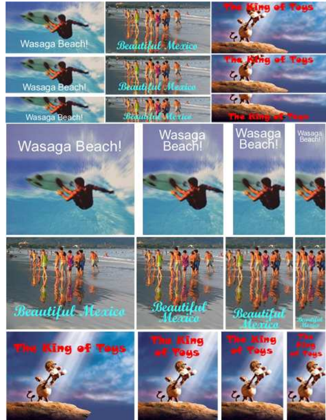
Figure 3: Sample Posters Resized Vertically and Horizontally