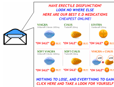
Figure 1. Extracting spam image from email.

work [4] involved extracting global Fourier-Mellin invariant features to fight image spam.