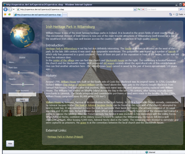
Figure 2. An Example Copernicus Article

The welcome page of Copernicus is very similar to the home page of Wikipedia. The major difference is that the user can notice an animation of a spinning Earth instead of a sphere of puzzles.