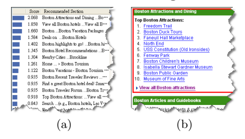
Figure 3: (a) The InsightFinder's recommendations are presented as a ranked list. A histogram is included to visually indicate the relative value of each unit's relevance to the context model. (b) Clicking on any item in the list automatically scrolls the web page and highlights the page unit in a red rectangle.

browser to automatically scroll to display the selected page unit. In addition, as shown in Figure 3(b), the selected unit is highlighted within a red box to clearly indicate where the recommended content can be found.