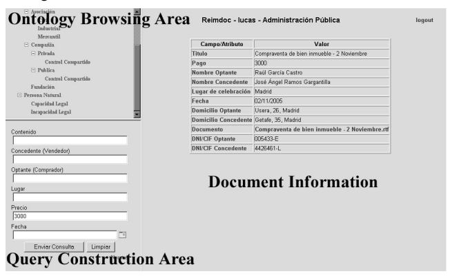
Figure 2. System User Interface.

Document Viewer connects to the Search Server, in order to retrieve the legal documents satisfying the query, and to the Ontology Server to browse and display the documents. Figure 2 shows the system user interface. On the left side we can see the ontology browsing area and the query construction area, and on the right side the document information.