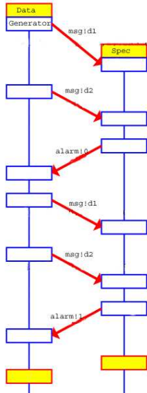
Figure 2: The output of the SPIN model checker

formation, we can verify if the data stream is conform to the specification. In this example we obtain the counterexample shown in a visual representation in Figure 2. The first process (the one on the left) represents the history manager and the second one (on the right) the specification. Each time instant the history manager sends to the specification data d_1 and d_2 through the channel message. After evaluating the data, the specification sends to the history manager the value of the alarm signaling anomalies with respect to the received data. In this example at the second time instant the sent data violates the specification.