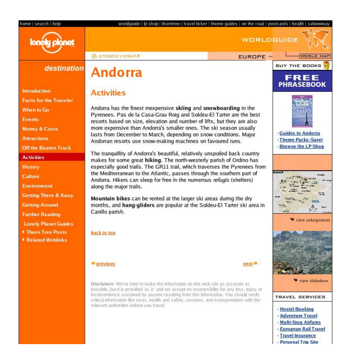
Figure 3: http://www.lonelyplanet.com/destinations/europe/andorra/activities.htm

These expressions are intended to be interpreted as standard regular expressions over words and their corresponding part-of-speech tags, which are indicated in curly brackets. Paraphrasing, INSTANCE matches each optional sequence of arbitrary characters (\w+) tagged as a determiner (DT), followed optionally by a sequence of small letters ([a-z]+) tagged as an adjective (JJ), followed by an expression matching the regular expression denoted by PRE, which in turn can be optionally followed by an expression matching the concatenation of MID and POST. Thereby, PRE and POST match a sequence of tokens in which the first character is capitalized and tagged either as a plural proper noun (NPS), a plural common noun (NNS), a common noun (NN), a proper noun (NP), an adjective (JJ) or an interjection UH<sup>3</sup>. MID matches a sequence of determiners 'the', prepositions 'of', the possessive marker ', a hyphen '-', a foreign word FW such as 'de,del,las,los,las' and lower case singular or plural proper and common nouns. For example, the tagged sequence Pas{NP} de{FW} la {FW} Casa{NP} would be recognized as an instance, whereby Pas would match the PRE, de la the MIDDLE and Casa the POST part of the above regular expression. The instances discovered this way in our running example web page are given in Table 1 as a cross 'X' in the S(system) column.