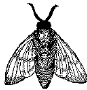
Figure 2: A sample black and white graphic (.eps format) that has been resized with the epsfig command.

of the table here with the table in the printed dvi output of this document.