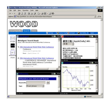
Figure 2: WOOD in action

We built the prototype implementation of WOOD with several modules developed, for instance, Wrapper, MetaAgent (metasearch components), Newspaper agents and Encyclopedia components. Figure 2 is a typical screenshot of WOOD in action.