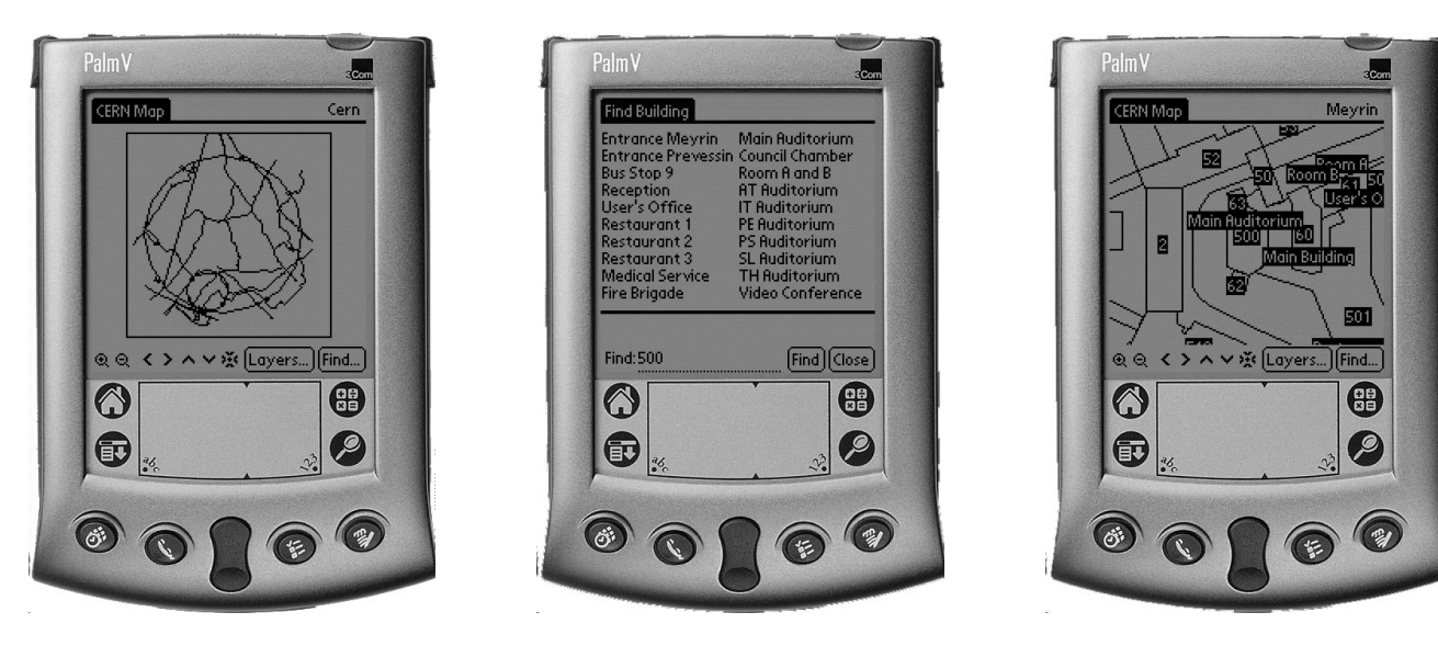
Figure 3: The Building and Map interface on a Palm V. On the left the initial screen showing the CERN site, in the middle the lookup screen, and on the right the result of a lookup of building 500, which can be scaled and panned interactively.