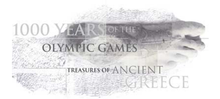
Figure 8. Screen grab from the homepage of the website, 1000 Years of the Olympics Games: Treasures of Ancient Greece, 2000. <a href="mailto:kreening-new-number-seek_olympics">http://www.phm.gov.au/ancient_greek_olympics</a>.

Despite the great opportunity to produce these aforementioned interactive Exhibition materials, the sponsors of the project (Intel Corporation) and the Museums' main interest involved the production of a state-of-the-art website. This website was intended to compliment the Exhibition, and to demonstrate the viability of the Internet to supplement and extend materials offered locally in the Museum. The ability to give access to this material to wide audiences and the fact that it will eventually outlive the Exhibition by two years is also the advantage of this medium.