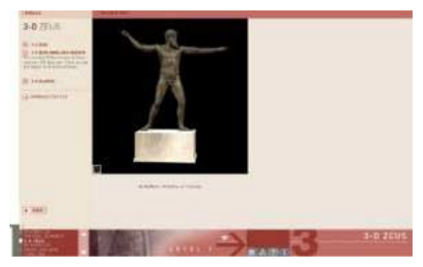
Figure 11. Screen grab from the 3D Zeus, 1000 Years of the Olympics Games: treasures of Ancient Greece website, 2000. <a href="http://www.phm.gov.au/ancient_greek_olympics">http://www.phm.gov.au/ancient_greek_olympics</a>.

3. 3D Zeus: a web version of the laser scan of the Zeus of Artemision (using the Zoom Viewer plugin), with the option to view as a 3D anaglyph through downloadable anaglyph glasses. The Zeus data was very dense to start with (and was finally reduced to 2 million odd polygons). This model was stitched in 3D Studio Max and an animation was produced. Live Picture was used to make the animation an 'object'. The anaglyph version was made by composting the red and blue images.