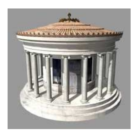
Figure 2. Work in progress, rendering the Pryaneion.

The Adler and Curtius publications provided detailed ground plans of most buildings. As well, the elevations were usually calculated, and the extant decorative elements, mainly terracotta simae and akroteria , were associated with each building. Major additions or changes to some buildings were taken from the later publications. The drawings were used directly by the modelers to recreate each building.