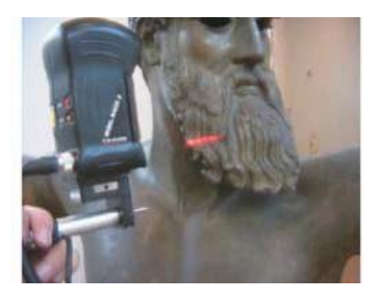
Figure 5. Reconstruction from the interior of the Temple of Zeus.

One of the most significant sculptures in the National Archaeological Museum in Athens is the statue of Zeus from Artemision (Artemesium), also considered to be perhaps a statue of Poseidon. This bronze sculpture is slightly larger than life size, and was found in 1926 in the sea off Cape Artemision. It is one of the few surviving examples of Early Classical statuary. The laser scan of the Zeus allowed this object the travel, in a virtual sense, from Athens to Sydney.