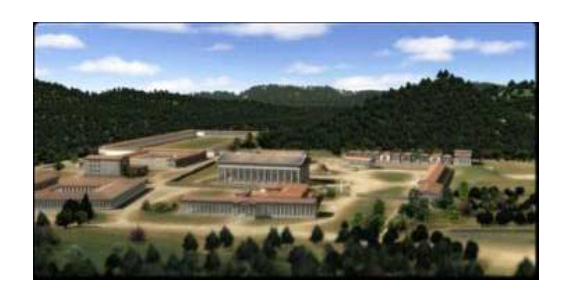
Figure 1. South-southeast aerial view of the reconstruction.

This paper has been reproduced (with varying emphasis) at other fora. These include Museums and the Web, Seattle, March 2001 [4]; and, Virtual Systems and Multimedia Conference, Gifu, October 2000. [5]