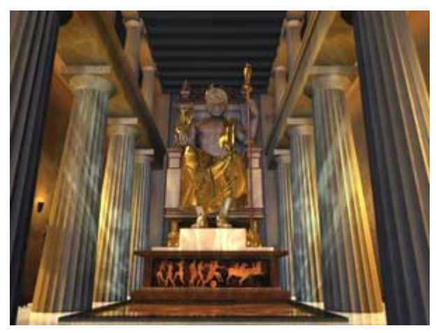
Figure 5. Reconstruction from the interior of the Temple of Zeus.

More extensive discussion on the archaeological basis for reconstruction is available from the project website. [30]