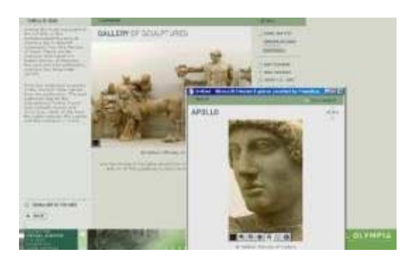
Figure 10. Screen grab from the Temple of Zeus statues as displayed in the Museum of Olympia, 1000 Years of the Olympics Games: treasures of ancient Greece website, 2000. <a href="http://www.phm.gov.au/ancient_greek_olympics">http://www.phm.gov.au/ancient_greek_olympics</a>.