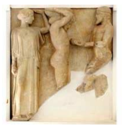
Figure 3. Metope X from the Temple of Zeus. The Apples of the Hesperides. Archaeological Museum at Olympia.

roof decorations excavated at the site was particularly helpful in this regard. Buildings which must have had pedimental sculpture or for which some fragments of sculpture remain, such as the Metroon, were given pale blue pediments, rather than attempting a poor reconstruction. Doors and lattice screens were based on those depicted on black and red figure vases.