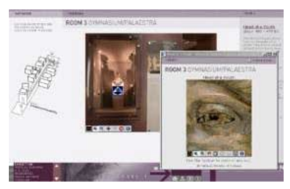
Figure 9. Screen grab from the virtual Exhibition of the website, 1000 Years of the Olympics Games: treasures of Ancient Greece, website 2000.

Apart from the standard plugin, Abode Acrobat Reader, the main plugin is the Zoom Viewer by MGISoft. The latter has two main utilities: it allows the high-resolution images to be stored on the server and streamed to the user on demand (thereby reducing bandwidth requirements); and it prevents the users from saving the materials to their hard drives. This last feature is of extreme importance to the Greek Hellenic Ministry of Culture and the Museum who wish to protect copyright. As noted, none of the Exhibition objects (also displayed on the website) had been displayed outside Greece before. With a history of contentious international relations over Greek antiquities it was very important to all those involved that every measure was made to prevent unwanted use of the digital materials. Another important design decision was not to use Virtual Reality Mark-up Language (VRML) for website version of the Olympia reconstruction. In its current form VRML is not considered to be a robust or userfriendly environment for inexperienced users on the Internet (comment made in reference to the digital version of Olympia specifically). However the author notes visualization in 3D is certainly the way forward for the display of such materials in the future, and major developments continue in this field. Limiting the number of plugins was also an important consideration.